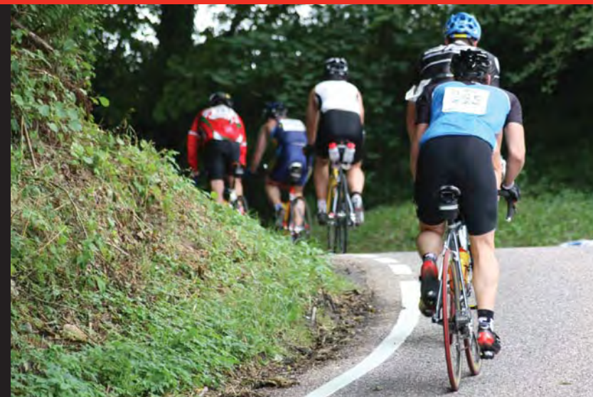
Ride past Lake Berryessa, the Glory Hole, Napa Vineyards, majestic oaks and the spring colors of our beautiful Northern California landscape.